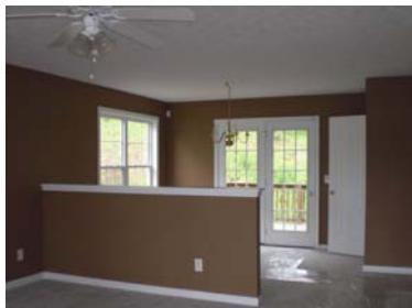
JE Moss Elementary